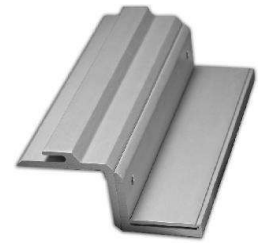
300-20005: Single Split Inswinging (tj) Magnetic Lock 320