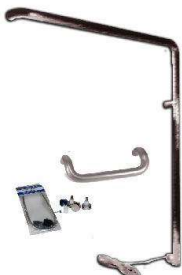
300-30031A: Exit Device Tubular 'L' Shaped Touch Bar Kit 32" x 42-1/2" - Bright Brass