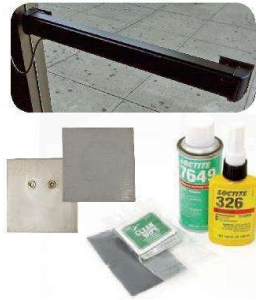
100-00098: Exit Accessory - Glass Bar Mount Kit - Includes Adhesive, Mounting Brackets & Cover Plates