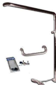
300-30031B: Exit Device Tubular 'L' Shaped Touch Bar Kit 32" x 42-1/2" - Chrome