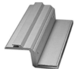
300-20017: Single Split Inswinging (TJ) Magnetic Lock 390