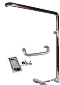
300-30031C: Exit Device Tubular 'L' Shaped Touch Bar Kit 32" x 42-1/2" - Brushed Stainless Steel