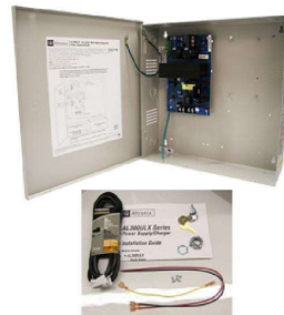
200-20018: Power Supply 12/24VDC 2.5 Amp