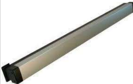
300-30002F: Exit Device Narrow Stile Mortise Bar 36" Clear w/ 1-1/8" Backset