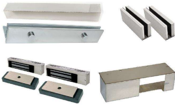
300-10017: Bracket - Maglock - Double Herculite Door Stainless Steel Magnetic Lock "L" Bracket w/ Magnet Cover, Motion REX Bracket and Cover, 2 - Universal Brackets with Stainless Steel Outer Covers, Finish Satin Stainless Steel -