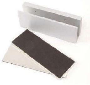
300-20002: 390 Magnetic Lock Herculite Bracket

Prices are subject to change without notice, always confirm current pricing with Parabit Sales Department prior to quoting your client.