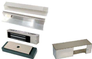
300-10041: Single Kwaneer Door Stainless Steel Magnetic Lock "L" Bracket w/ Magnet Cover, Motion REX Bracket and Cover, Finish Satin Stainless Steel - (Magnet and Motion REX sold Separately)