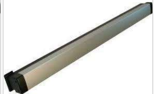
300-30002H: Exit Device Narrow Stile Mortise Bar 36" Clear w/ 1-1/2" Backset