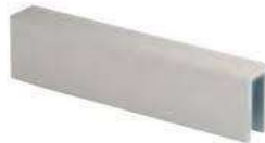
300-20001A: Herculite Bracket for 320 Magnet Lock