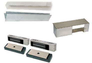
300-10040: Double Kwaneer Door Stainless Steel Magnetic Lock "L" Bracket w/ Magnet Cover, Motion REX Bracket and Cover, Finish Satin Stainless Steel - (Magnet and Motion REX sold Separately)