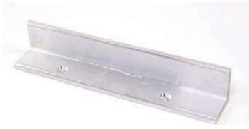
100-00061: Bracket - Maglock Angle for M38 Maglock

Prices are subject to change without notice, always confirm current pricing with Parabit Sales Department prior to quoting your client.