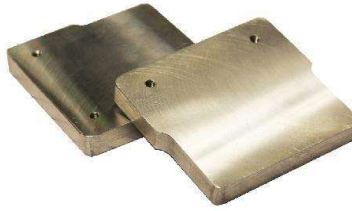
300-20004: Exit Accessory Glass Door Bracket for Type 2 Exit Devices