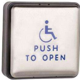
100-00192: Handicap Device Handicap Logo Exit Button - Square Size: 4.75 x 4.75 x 0.62 - Color: Blue for Automatic Door Operator (Optional Surface Mount Box 100-00194)