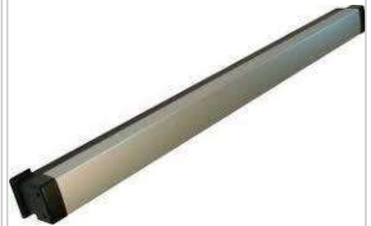
300-30002E: Exit Device Narrow Stile Mortise Bar 36" Clear w/ Cylinder Dogging