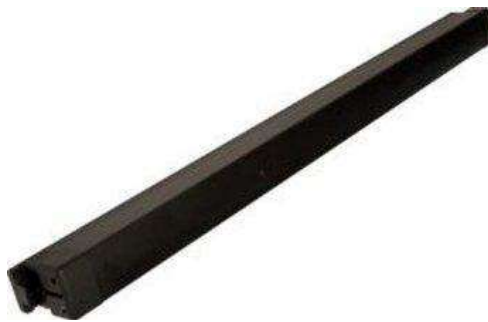
300-30002D: Exit Device Narrow Stile Mortise Bar 42" Duranodic