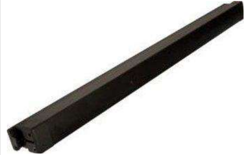
300-30002B: Exit Device Narrow Stile Mortise Bar 36" Duranodic w/ LHR