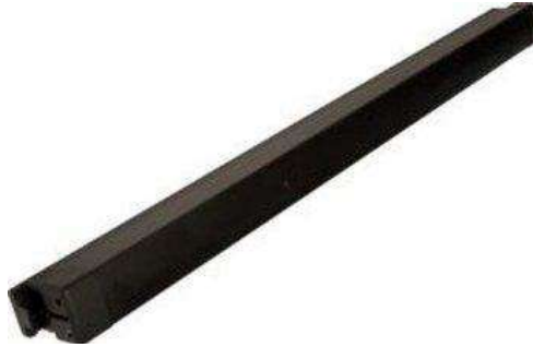
300-30002A: Exit Device Narrow Stile Mortise Bar 36" Duranodic w/ 1-1/8" backset