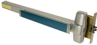
300-30010B: Exit Device Mortise Mechanical Latch Release Bar 48" - Clear

Prices are subject to change without notice, always confirm current pricing with Parabit Sales Department prior to quoting your client.