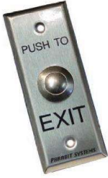
300-30032: Exit Device Momentary DPDT Exit Button Narrow - Size: 4.4" H x 1.8" W Stainless Steel - Finish

Prices are subject to change without notice, always confirm current pricing with Parabit Sales Department prior to quoting your client.