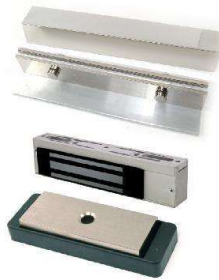
300-10024: Bracket - Maglock - Single Herculite Door Stainless Steel Magnetic Lock "L" Bracket w/ Magnet Cover, Motion REX Bracket and Cover, 1 - Universal Bracket with Stainless Steel Outer Cover, Finish Satin Stainless Steel - (Magnets and