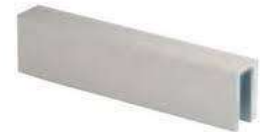
300-20001B: MagLock - Accessory - Herculite Bracket for M420 Magnet Lock