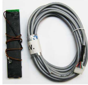
300-30011: Exit Accessory Replacement Sensor Board