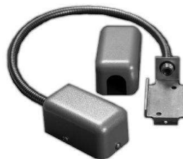
300-20016: Cable Accessory Exit Bar Armored Cord With Box