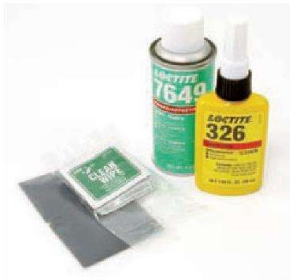
300-20012: Exit Accessory Glass Adhesive Kit