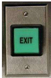
100-00208: Exit Device Pneumatic "PUSH TO EXIT" Switch w/ Plate Exit Button - Wide Size: 1-9/16" - Color: Green