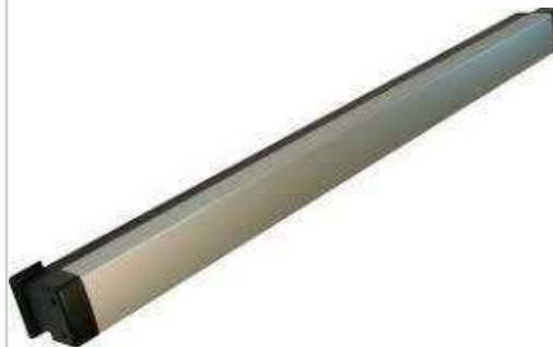
300-30002G: Exit Device Narrow Stile Mortise Bar 36" Clear w/ 31/32" Backset