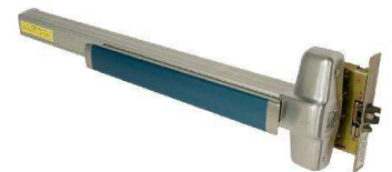
300-30010A: Exit Device Mortise Mechanical Latch Release Bar 36" - Clear