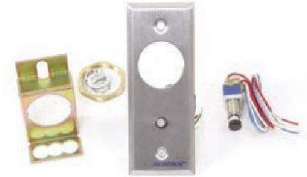
300-30014: Bypass Device Momentary Mortise Key Override Switch - DPDT - w/Narrow Plate