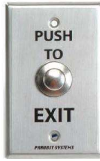
300-30037: Exit Device Momentary DPDT Exit Button Wide - Size: 4.563 x 2.875" - Clear