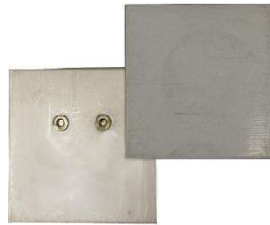
300-20013: Exit Accessory Glass Door Bracket for Type 1 Exit Devices