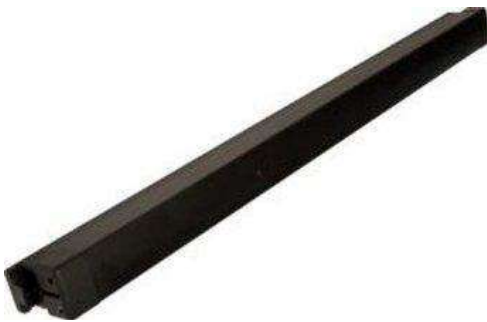
300-30002C: Exit Device Narrow Stile Mortise Bar 36" Duranodic w/ RHR