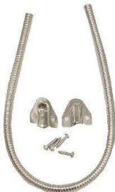
300-20015: Cable Accessory Exit Bar Armored Cord w/ PVC Anchors