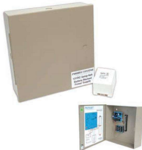
200-10027: Power Supply - 12VDC 3 Amp Includes 16 5 VAC 40 VA Transformer 12"H x 12" W x 4 125" D