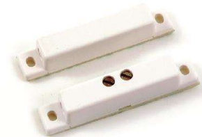
300-20014: Door Contact white