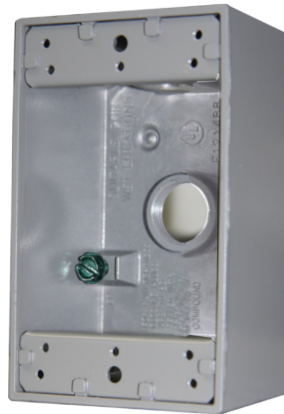
Surface Mount Weather Resistant Back Box