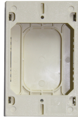
Surface Mount Back Box